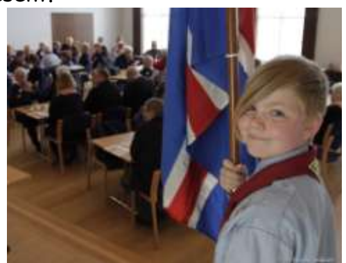
This young scout welcomed the guests with an Icelandic flag

There were around 50-60 Guild scouts present.