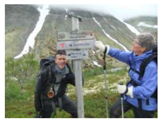
From last year tour

A hiking tour in the mountains is planned for 6.-9. August, and is open for participants from other Nordic/Baltic countries.