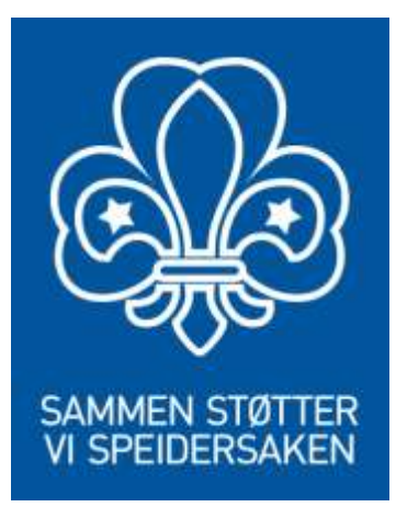
"Together we support scouting" (This is our national slogan and logo)

The statutes were amended so that guilds no longer base their activities on "guild ideals", but on "scout ideals". The two concepts are synonymous, and the change emphasises the close ties between the Guilds and the rest of the scout movement in Norway. However, a proposal to adjust quotations in the statutes from the Scout Law had to be postponed, since the two federations have been unable to agree on a new formulation of the Scout Law for Norway.